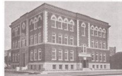
St. Michael Torre School - Circa 1915