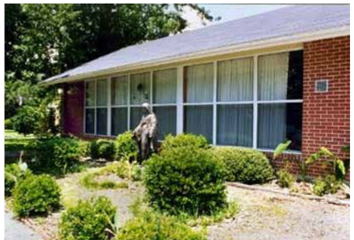
St. Michael Interparochial School - 2000

In 1949, the Sisters moved "up the hill" to their new convent at the corner of Baylen and Jackson Streets, a former home that had briefly been the Azalea Hotel. In 1961, St. Michael Elementary School was built next door at its present location at 601 North Palafox. At that time, it became an Interparochial School. The "Torre School" was razed to make room for what is now Region's Bank. (In 2004, the vacant convent building was destroyed by fire.)